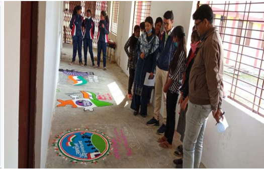
Quiz Competition & Rangoli