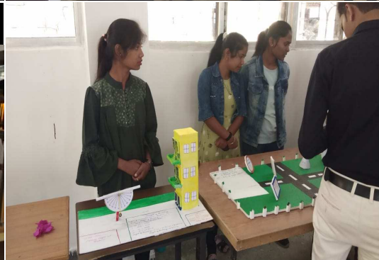
Painting & Model Presentation, Lab